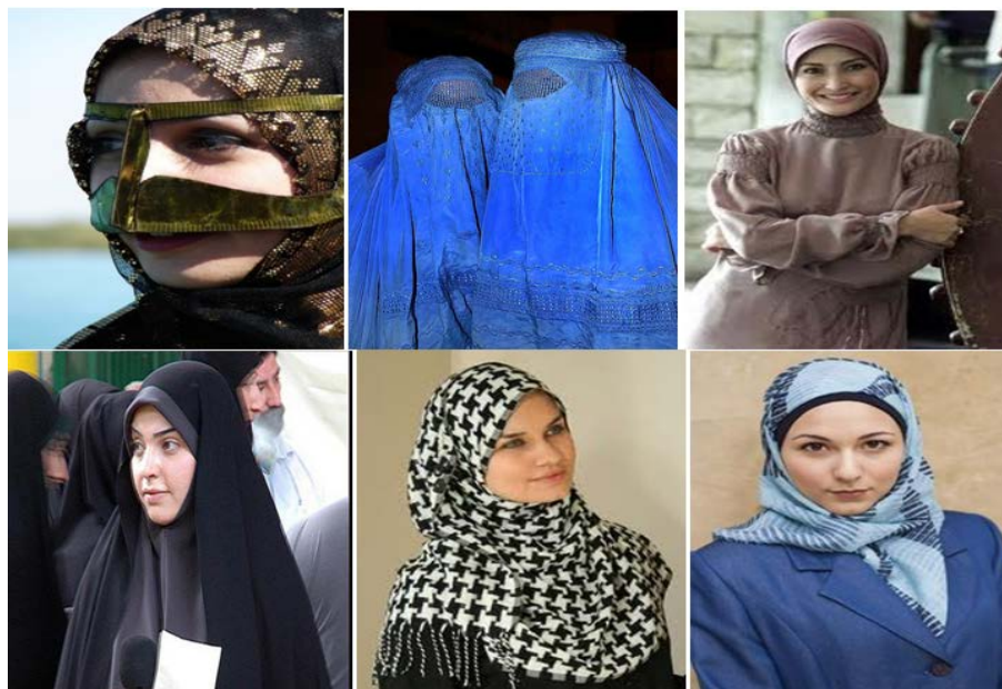
Figure 2.1 Different cultures for implementation of hijab. From above left to right: Yemen, Afghanistan, Syria, Iran, Turkey, and Iran

from the American context of Catholic nuns covering their heads with wimples that tied in the back not in the front. There is a community of Muslims under the leadership of Imam Warith Deen Mohammed (WDM community) founded in 1975 and recognized as the largest organized group of African American Muslims. The women of this community wear head wraps that raise the head, leaving the ears uncovered and revealing the upper neck. This model of head wrap shows their culture and modesty. There are diverse culture expressions of covering in Islam, and the Quran does not advocate a particular fashion of dress (Karim, 2009). Figure 2.1 shows the corresponding hijab for a number of cultures regarding different countries.