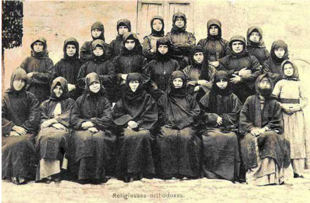
Figure 2.2 Christian Nuns with hijab in Turkey http://www.forumbiodiversity.com/showthread.php?t=31632