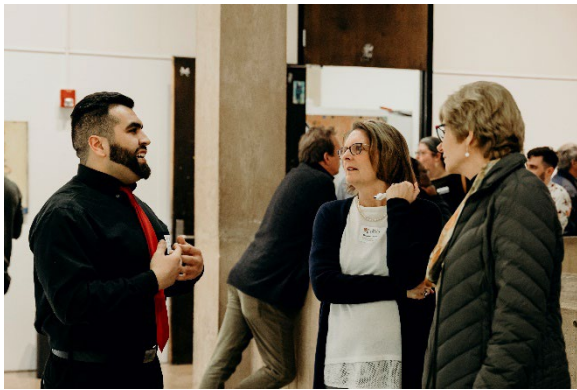
Photo from previous Emerging Artists Showcase