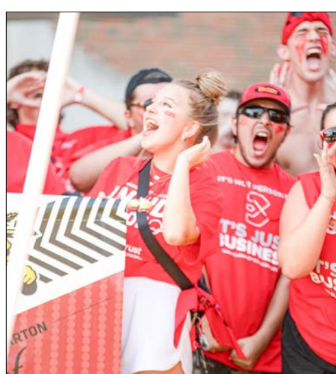
Students representing the Barton School of Business cheer during the initial roll call at the start of the games. Business won the Clash's spirit award in both 2021 and 2022.