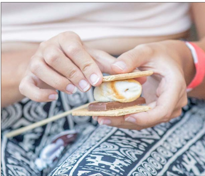
Attendees of the S'mores and Oars event on Aug. 30 had the option of sitting around a bonfire and crafting their own s'mores.