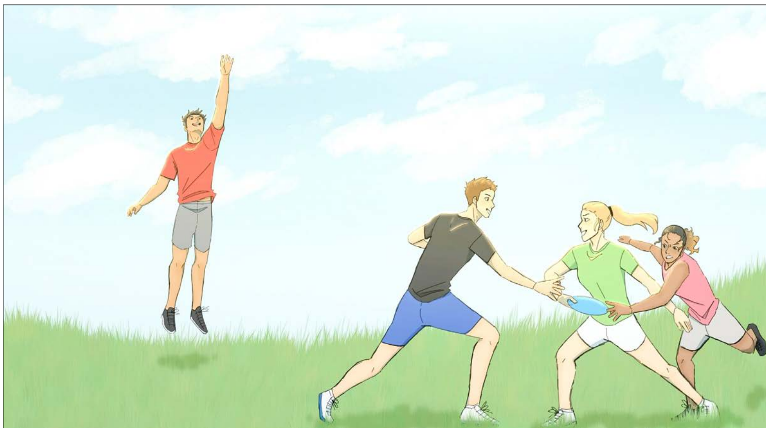
Illustration by Cameryn Davis / The Sunflower