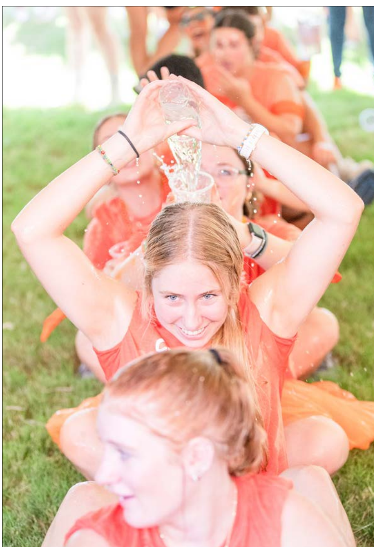
The College of Health Professions play in the water relay game on Aug. 25. The game consisted of pouring cups of water over each players' head, in attempt to fill a bucket.