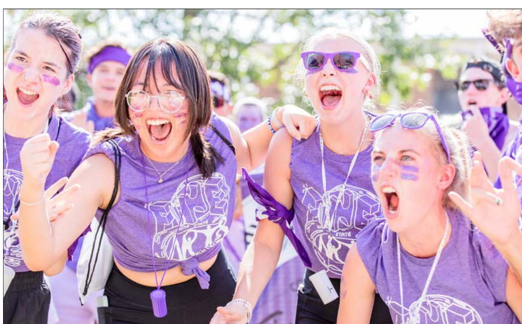
Students from the College of Fine Arts cheer during the initial roll call of the 2023 games. Fine Arts won the games in 2021.