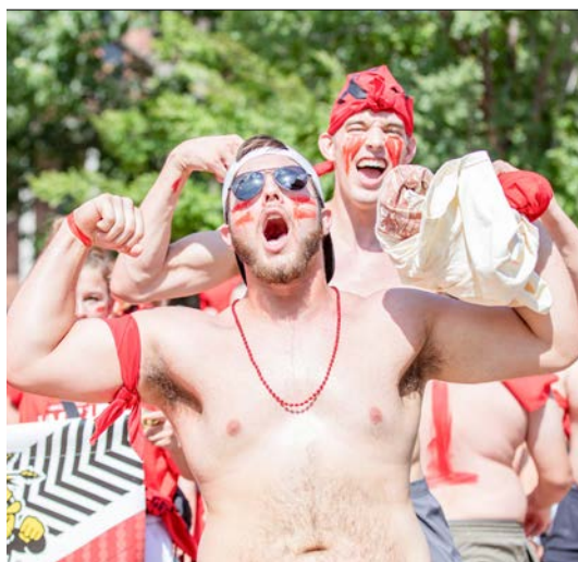
Students representing the Barton School of Business flex as they cheer for their college. The Barton School of Business took home the spirit award the last two years.