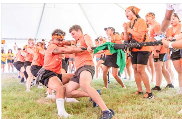
The College of Health Professions participate in the tug-of-war game. The players were supported by their college, cheering from behind.