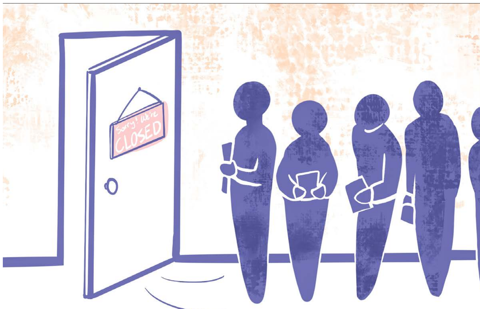
Former Student Government senators speak out about not receiving interviews for executive positions. | Illustration by Wren Johnson / The Sunflower