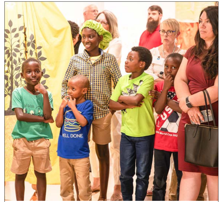
A family from the community attends the fall opening celebration on Aug. 24 at the Ulrich.