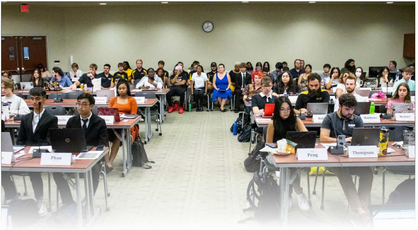
The Student Government Association's meeting room was packed as several student organizations stood in on the Aug. 30 meeting to hear about the fate of their organization's funding.