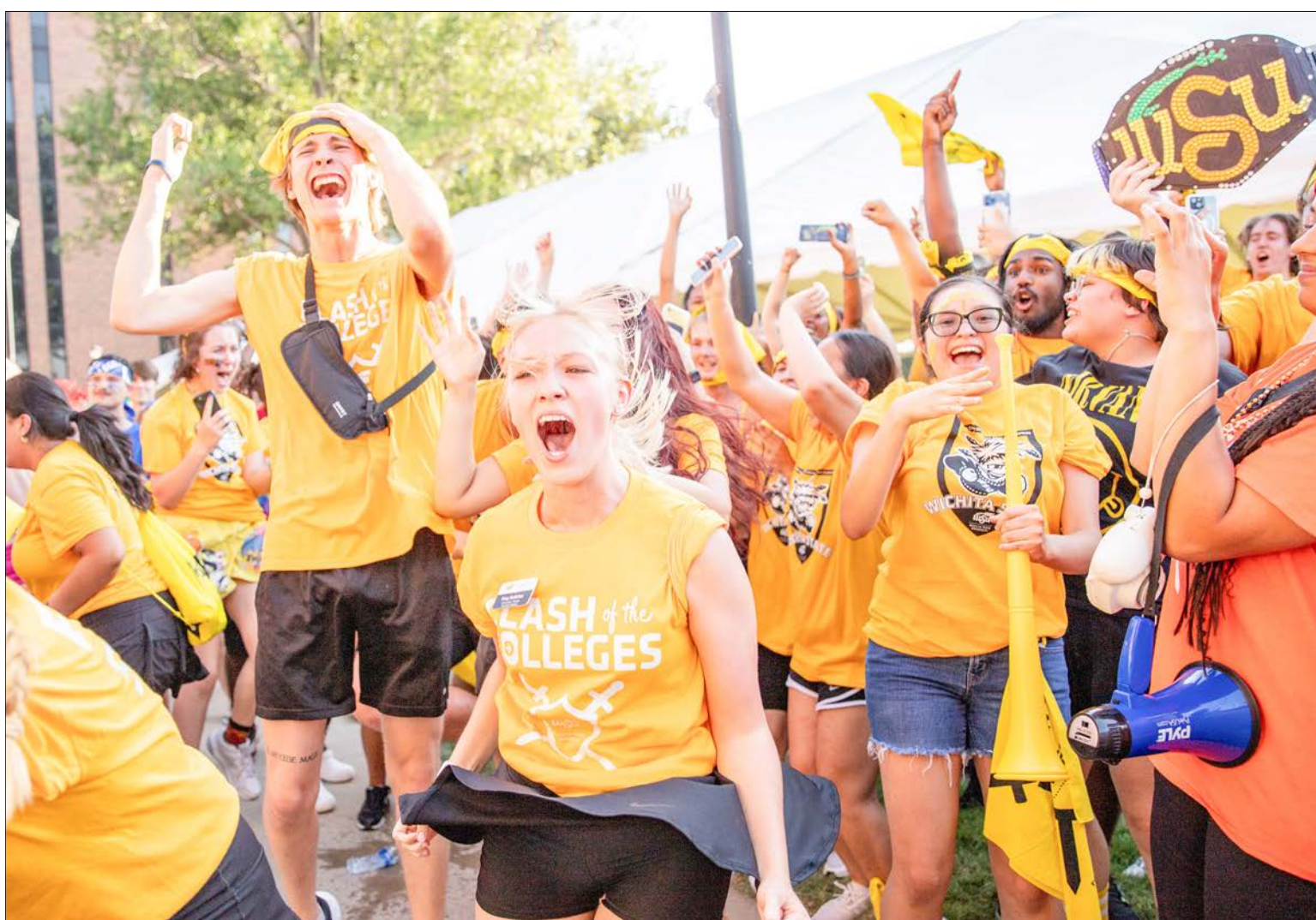
Students from the Fairmount College of Liberal Arts and Sciences celebrate after they are announced as the 2023 Clash of Colleges winners. This marks the college's first win in the Clash.

College of Liberal Arts and Sciences takes first Clash of Colleges victory