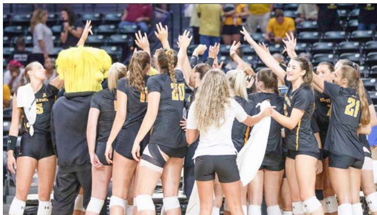
At the end of the fourth set, the Wichita State Shockers huddle together momentarily. The Shockers won against the Sooners on Aug. 17, their first match since 2012.