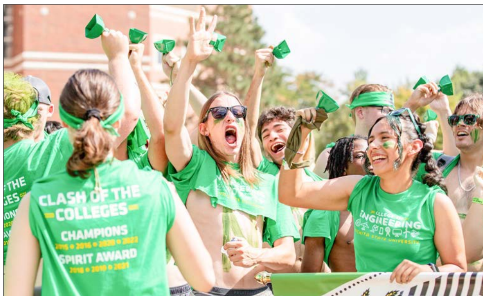
College of Engineering students yell and ring their cow bells before the start of the Clash of Colleges.