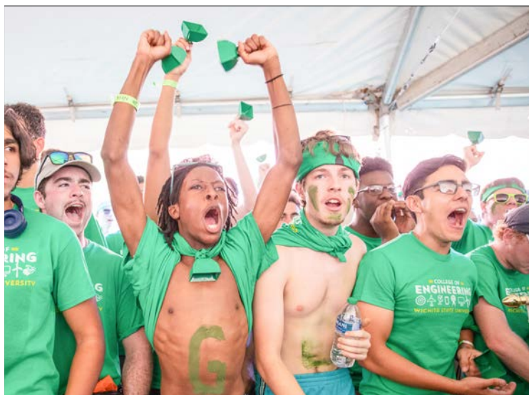
As their college participates in the tug-of-war game, spectators from the College of Engineering cheer. Engineering earned the 2023 spirit award for Clash of Colleges.