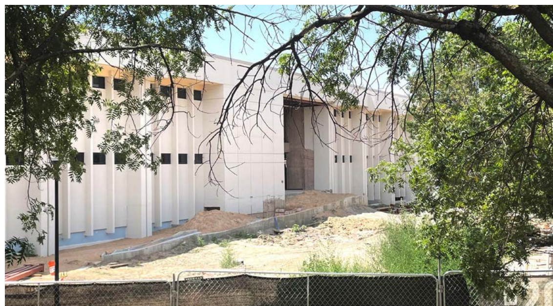
Clinton Hall construction on Aug. 3, 2023.