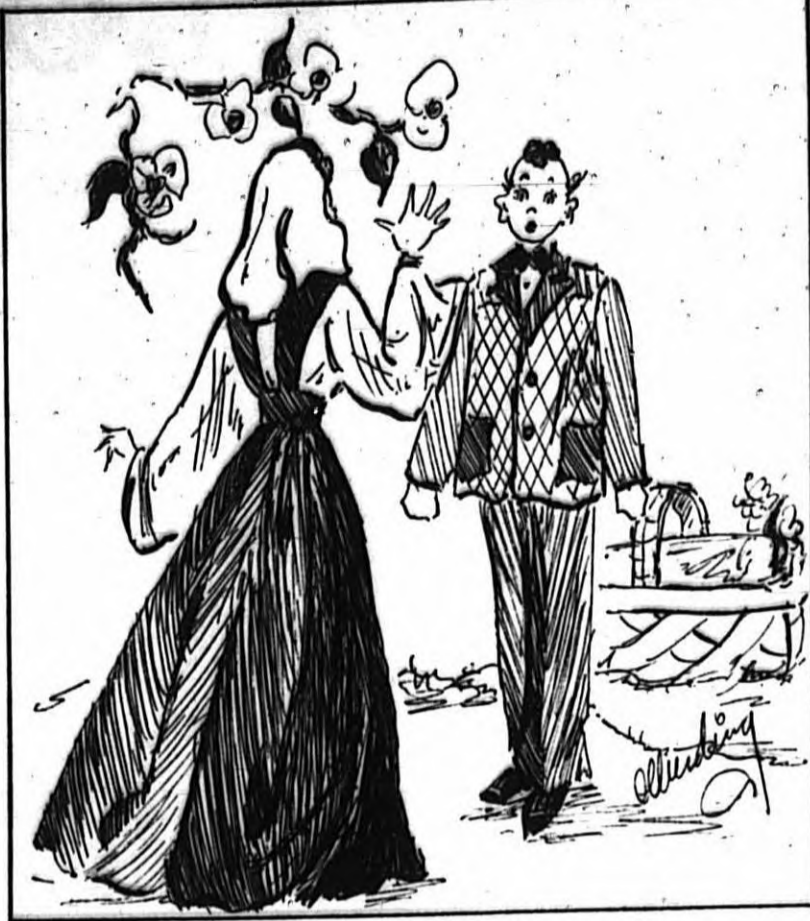
Did you come in that May basket?