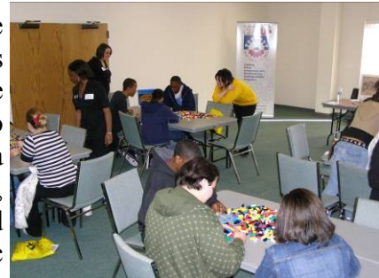
Adventures Team Building Workshop

college degrees would be needed to create a useable, attractive and safe public building.