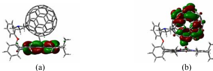
Fig. 3. Ab initio B3LYP/3-21G(*) optimized geometries of flexible bridge porphyrin-C 60 (a) HOMO and (b) LUMO

The computational studies were performed using density functional methods (DFT) at the B3LYP/ 3-21G level. The structures of rigid and flexible pacman porphyrin-fullerene compounds were optimized to a stationary point on the Born-Oppenheimer potential energy surface.