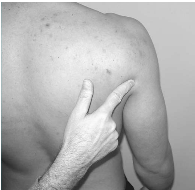
Figure 2 View of area of point tenderness in posterior shoulder.

Reprinted with permission from Agur ARM. Grant's Atlas of Anatomy . 9th ed. Baltimore: Williams and Wilkins; 1991, pg 386.