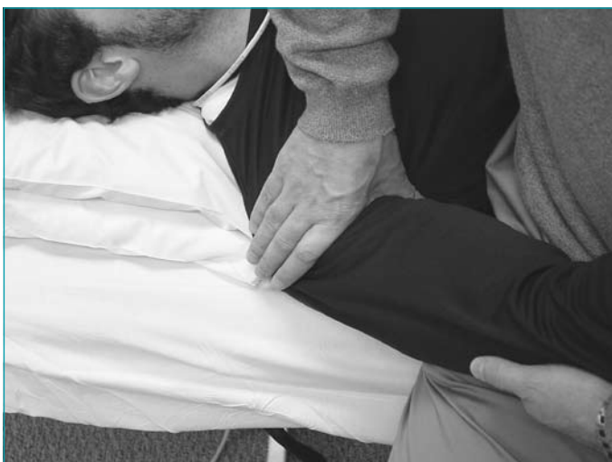
Figure 3 Posterior capsule joint mobilization technique.

If conservative treatment fails to relieve QSS symptoms, the athlete should be referred for further evaluation by his or her physician. Conservative management is not successful for every case of QSS. Surgical release of abnormal connective tissue within the quadrilateral space may be necessary for resolution of the condition. ■