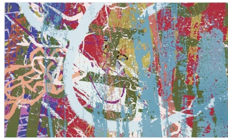
Fig. 2. Ingrid Calame, From #258 Drawing (Tracings from the Indianapolis Motor Speedway and the L.A. River) , 2007, enamel paint on aluminum, 72" x 120"