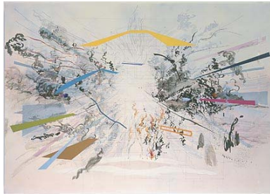
Fig. 1. Julie Mehretu, Untitled , 2001, ink and acrylic on canvas, 60" x 84"