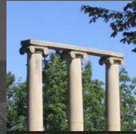
STUDENT GOVERNMENT >>