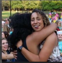
FRATERNITY & SORORITY LIFE >>