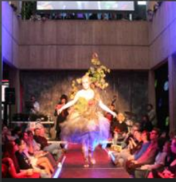
ARTS & CULTURE >>