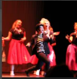
HISTORY & TRADITIONS >>