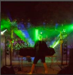
STUDENT INVOLVEMENT >>