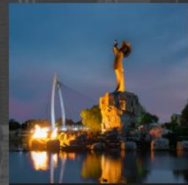
EXPLORE WICHITA >>