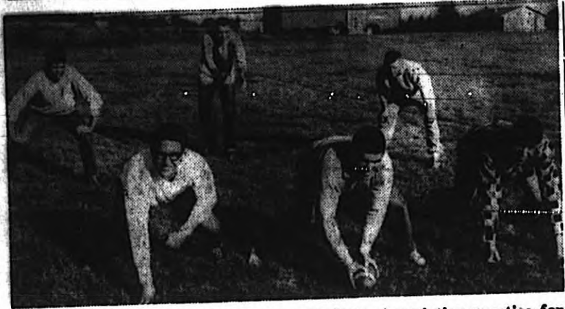
HIKE —Members of the Independent Students Association practice for an intramurals meet. Each team will play one game each week during the intramurals football season.