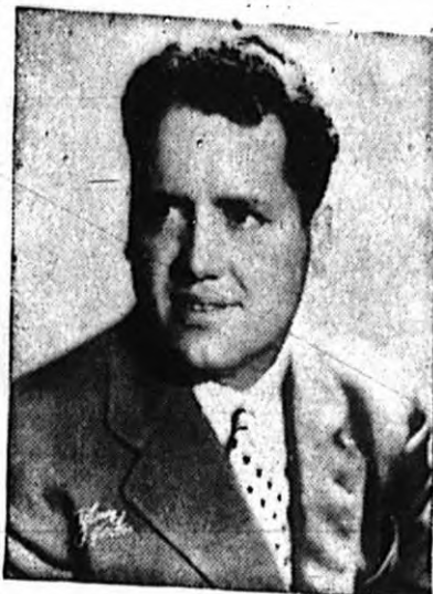
WILLIAM MILLER, noted Chicago tenor, will appear as one of the soloists during a public concert Sunday at the Forum.