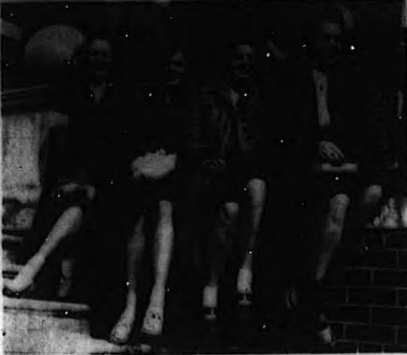
High on a Windy Hill March winds play merry havoc with skirts and hair these days as coeds anxiously await the coming of that turking little rascal Spring.