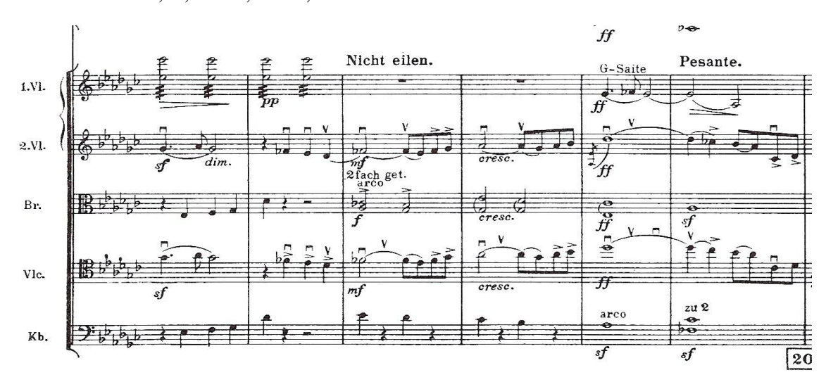
Figure 5 Gustav Mahler, Symphony No. 8 , Universal Edition, 1939. p. 83. Measures 133-8: Violin I, II, Viola, Cello, Bass.

The second example is not so agonizing, but because of the text in the chorus and tenor is more literal. Previously mentioned in conjunction with the Catholic Church's view of Woman, Dr. Marianus is calls out to the Mater Gloriosa by her three titles beginning in m. 724. It is on the word "koënig," or queen in m. 746 that the suspension occurs in the tenor and bass of chorus I, although in this case without the intensity found leading up to m. 137. This is portraying the eternal masculine of Dr. Marianus intimately yearning for everything Mater Gloriosa represents: serenity, contentment, and peace. By suspending on "koënig," Mahler acknowledges her authority as Queen, and therefore shows the relief that her grace will provide.