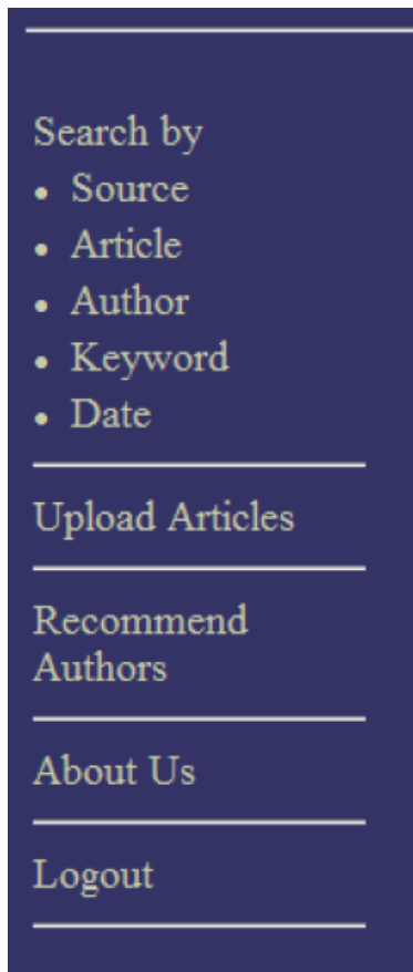
FIGURE 1 USER MENU